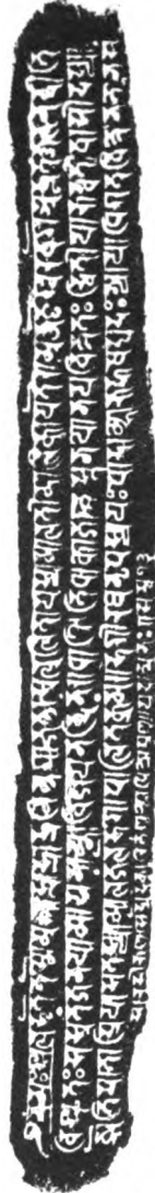
INSCRIPTION FROM A STONE RECENTLY FOUND AT MUDGAL-ASRAMA, KASHTA-HARANI GHAT, MUNGER.